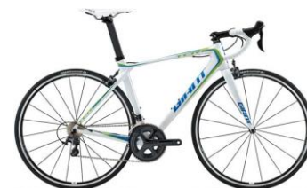
Carbon Road Bike