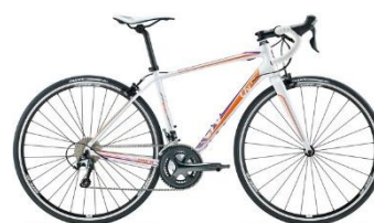
Aluminium Road Bike

A helmet will be provided if you do not have yours.